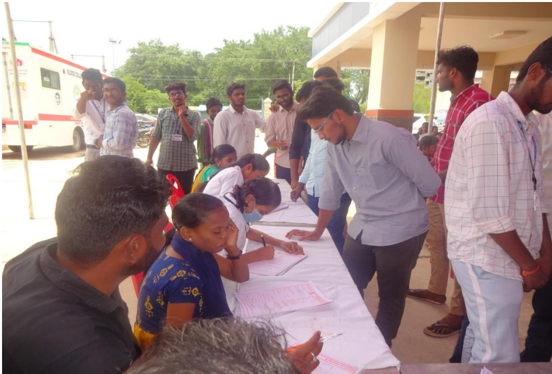
Registration of students at Blood Camp Organized by RedCross Society at NRT Govt Hospital