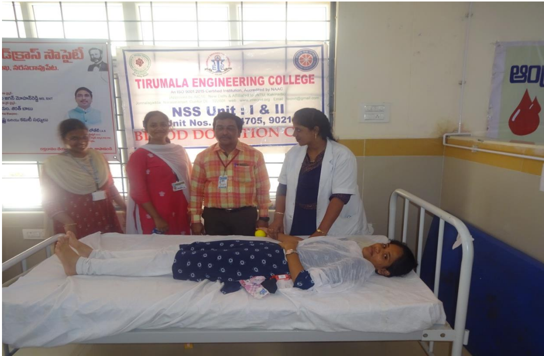
Blood Donation By AIML Student at Govt. Hospital NRT