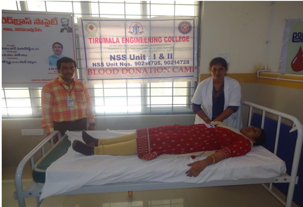
Blood Donation By a Student of TEC at Govt. Hospital NRT

Programme Officer N.S.S. UNIT TIRUMALA ENGINEERING COLLEGE JONNALAGADDA, Narasaraopet