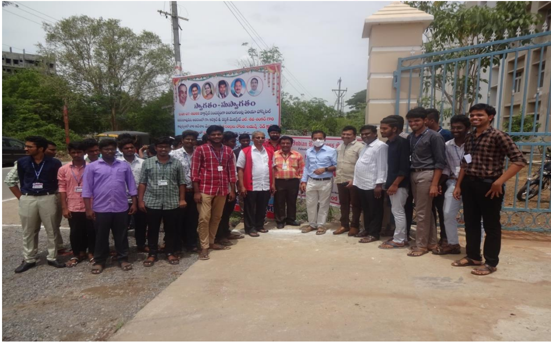
Students, RedCross Chairman and NSS PO at Blood Donation Camp