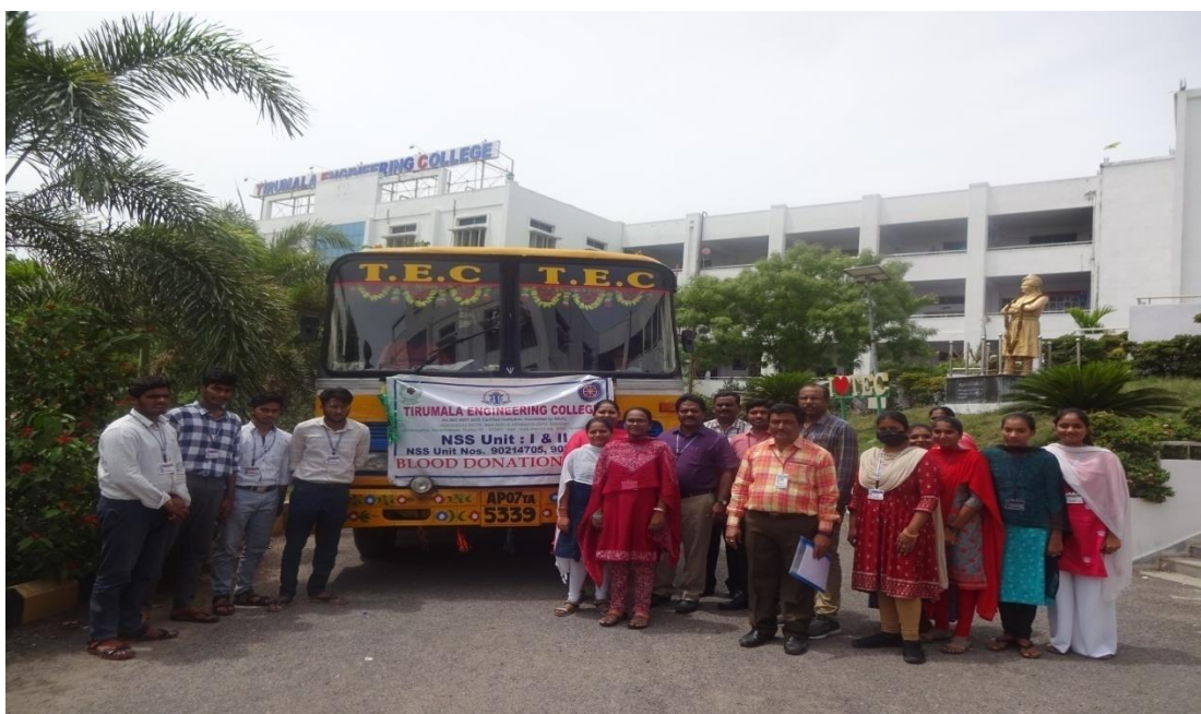
Students, Principal sir and NSS PO starting at college to Blood Donation Camp

Donation of blood is very critical and crucial for saving lives many patients and those who have met with accidents. It is as such a great service or contribution to the society and people living in it.