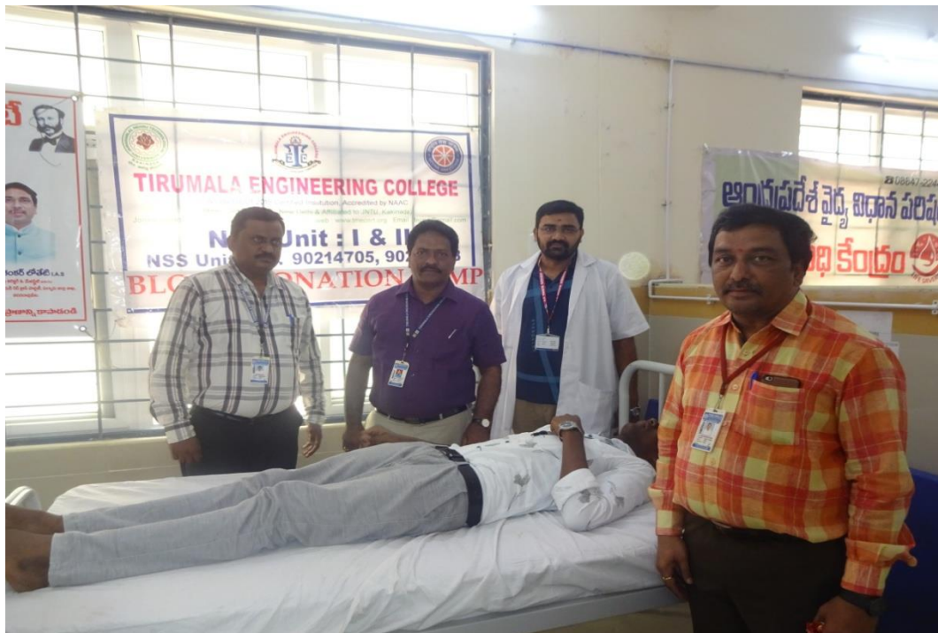
TPO, Principal Sir, Doctor and NSS PO at Blood Donation Camp